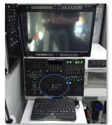
Mission Management Consol Example with DZM Installed

Bristow selected the DZM product platform to do the job. The DZM was an attractive proposition; being an all-in-one box solution with user-friendly keypad on