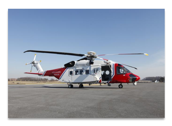
Sikorsky S-92 Ready for Action

The DZM units have been very reliable and Bristow are pleased with the support they have received from Flightcell. Their technical support staff have always been available and responsive, despite the time difference between the UK and New Zealand.